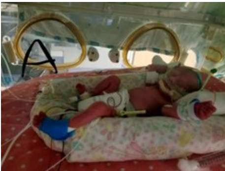
Baby Girl A—3lbs 3.2 ozs.