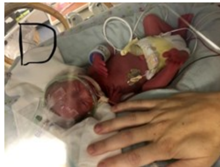
Baby Boy D—2lbs 10.7 ozs.